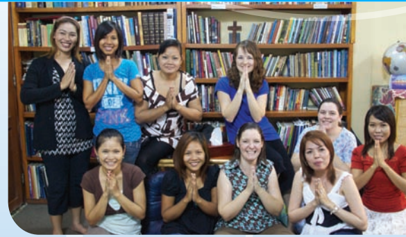
Women Ministry Leaders