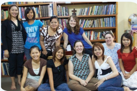
Women Ministry Leaders

The young men were like Adam in the Garden of Eden, suddenly realizing their need. They began to pray that the Lord would bring young women into the church. Through contact with NLF’s Filipino medical staff, the first woman joined the church. She was a 60-year-old nurse with a loving mother’s heart. While she was a blessing, the young men continued to pray!